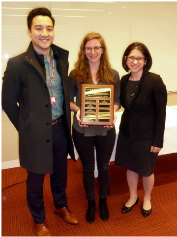
Weill Cornell Center for Human Rights