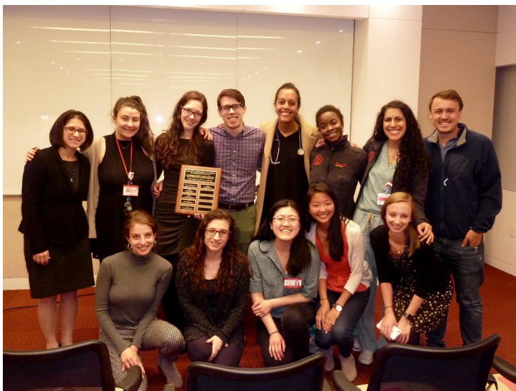
Weill Cornell Community Clinic